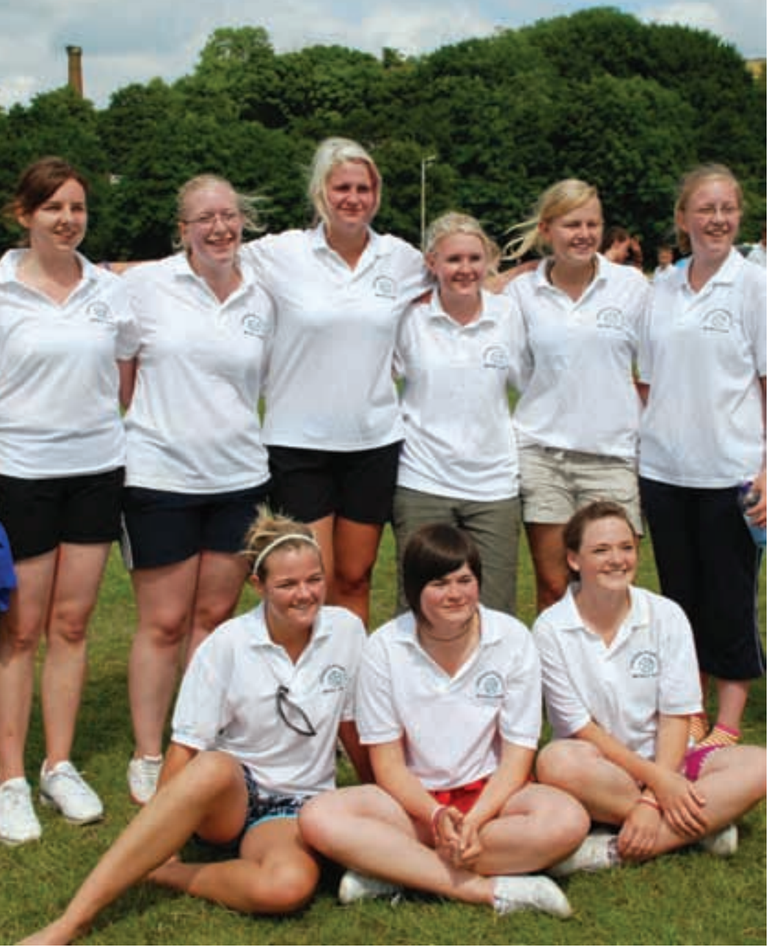
Yorkshire Region Netball Team