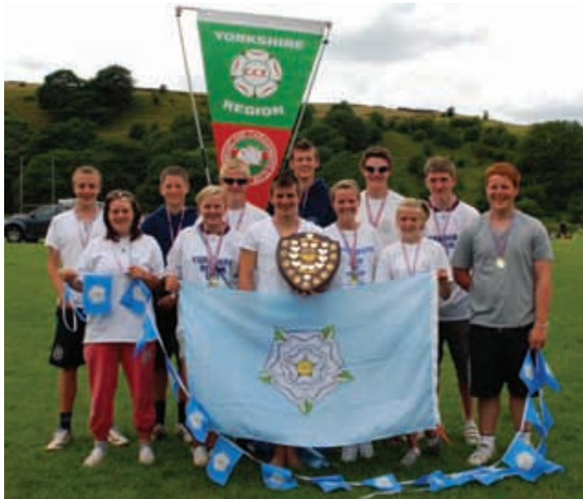
Yorkshire Region Austin Sports Team